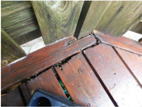
Some boards onthe rear deck show signs of rot