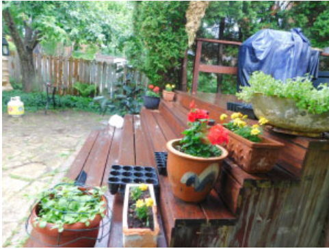
Handrail are required along the steps as well as properly spaced guardrails on side of deck