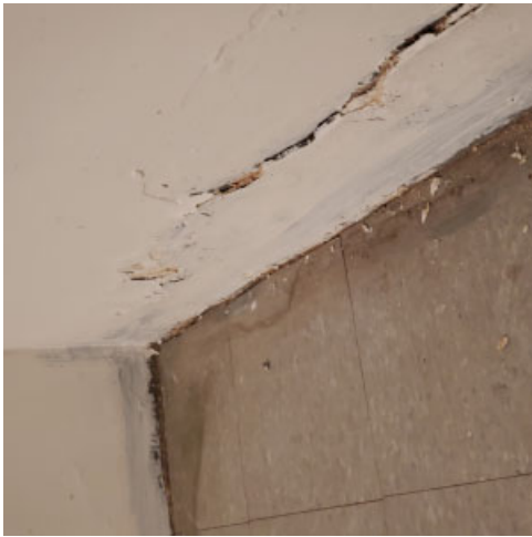
Rear wall of addition Previous water damage - dry when measured