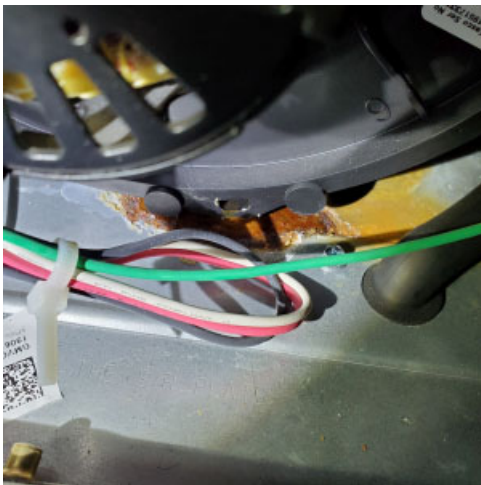
Condensate leak below vent motor