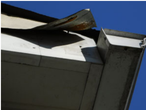
Repair aluminum cladding at front porch