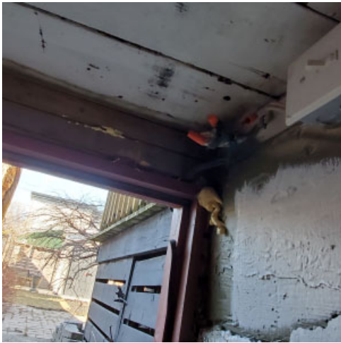
Connection not in junction box