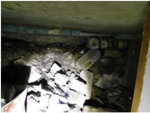
Foundation wall of rear walk up - under steps has collapsed- repair is recommended