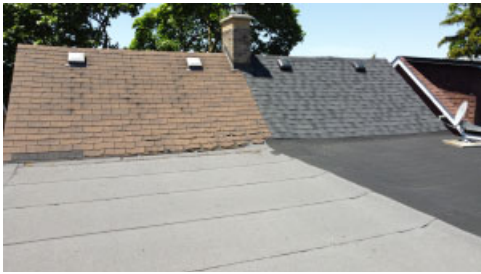
Shingles near the end of their life expectancy