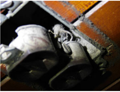
Receptacle on Knob & tube wiring on 3rd floor