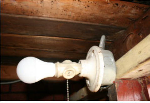
Shed- plug in light fixture is GFCI protected.