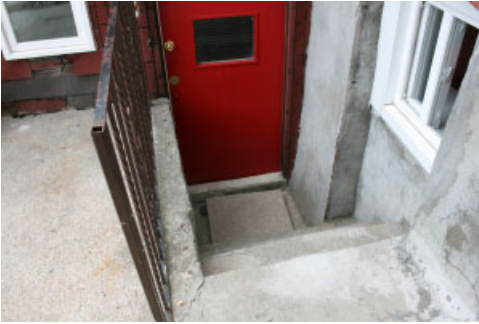
Handrail is required in staricase