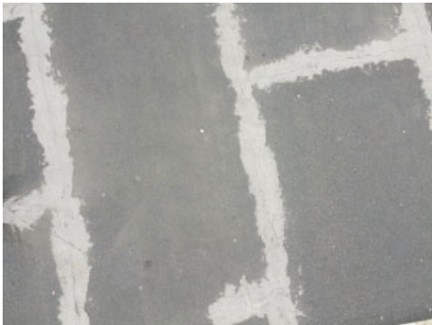
Seams between strips of roofing membrane are beginning to crack