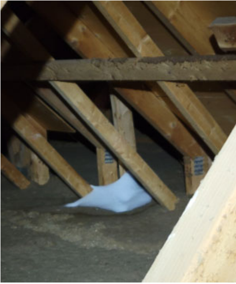
Accumulation of Snow in the attic