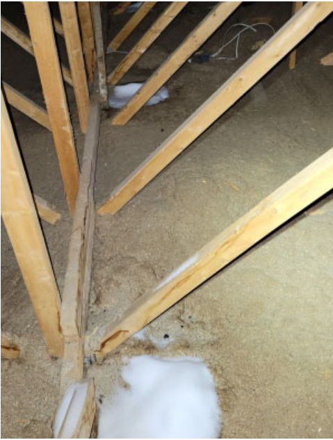
Accumulation of snow in attic under each roof vent -