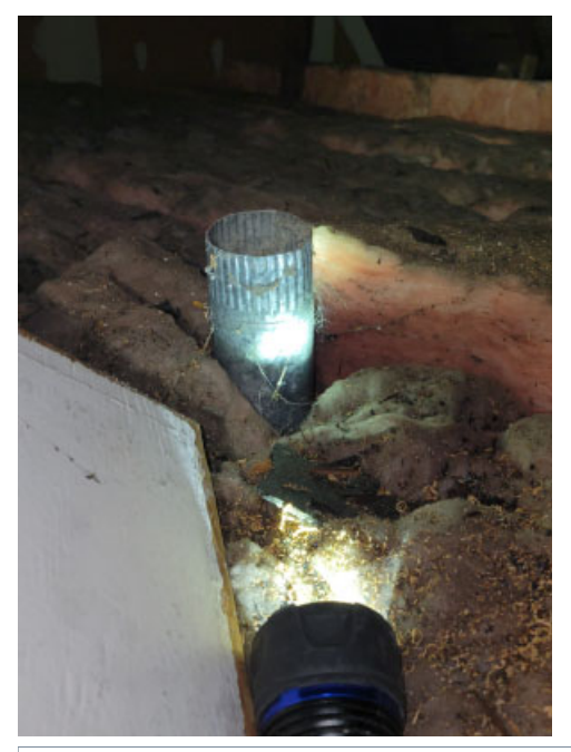
Washroom exhaust vent terminates in the attic