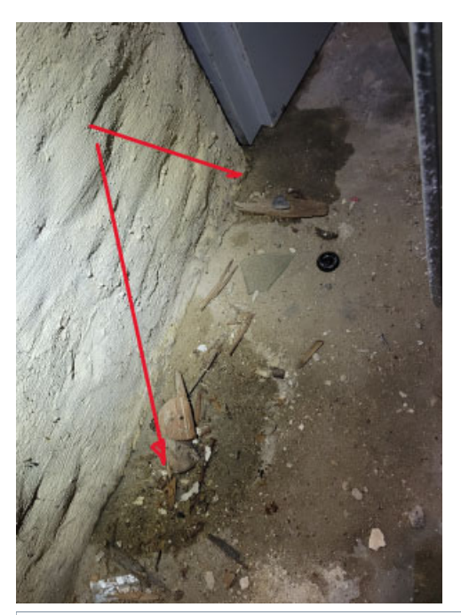
Active leak. Corresponds to location of disconnected downspout on the exterior